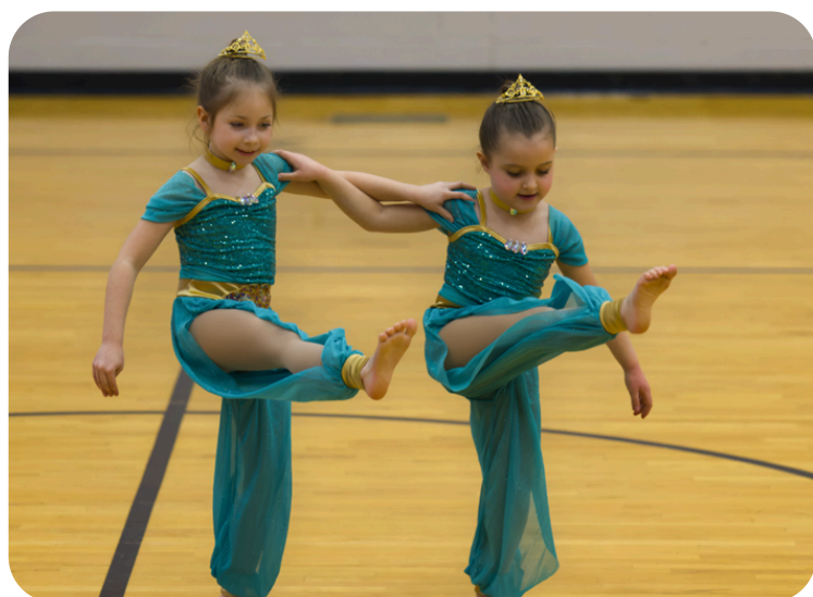
Pre - Competition Team